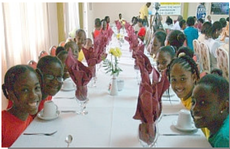
Happily waiting for their breakfast – some members of the Children's Bible Club Choir.

(Annual Prayer Breakfast cont'd) News Club , a church related club, which recently celebrated their first anniversary. The Children's Bible Club Choir renditions were beautiful... "All from memory!" said one amazed person.