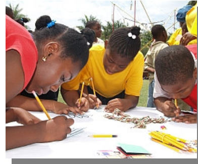
Writing prayer requests at Fun in the Son