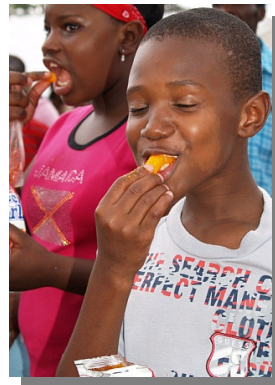
Mmm...good food for sale!

Gifts to the work of the Fellowship, which would be highly appreciated, can be sent to the National Office or lodged into our accounts. Bank of Nova Scotia (HWT) account:# 2948-10 Or NCB (HWT) account # 30-5028835