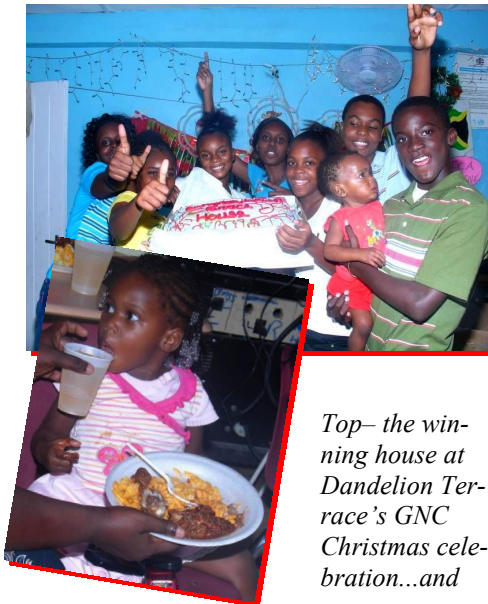
Top- the winning house at Dandelion Terrace's GNC Christmas celebration...and