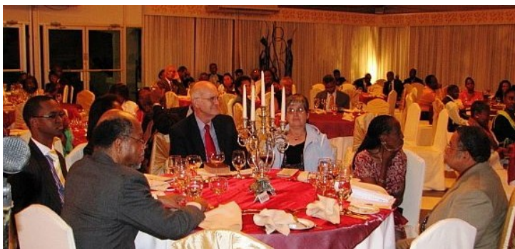
Some of those who attended