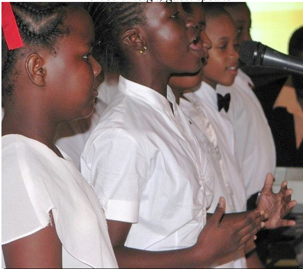
CBC choir members